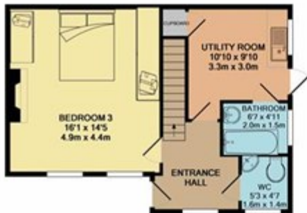
GROUND FLOOR APPROX. FLOOR AREA 482 SQ. FT. (44.8 SQ. M.)